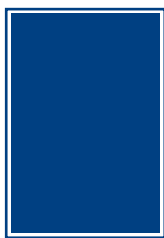
FULL PAGE 210x297mm + 4mm bleed (218x305)