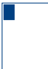
16TH PAGE PORTRAIT 43x66mm