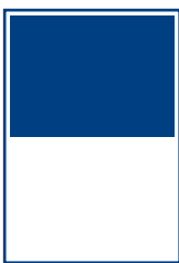
HALF PAGE HORIZONTAL 184x135mm