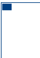
BOX HORIZONTAL 43x30mm