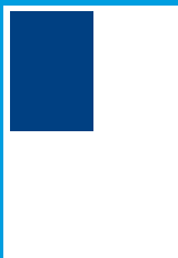
QUARTER PAGE 135x90mm