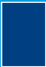
FULL PAGE 210x297mm + 4mm bleed (218x305)